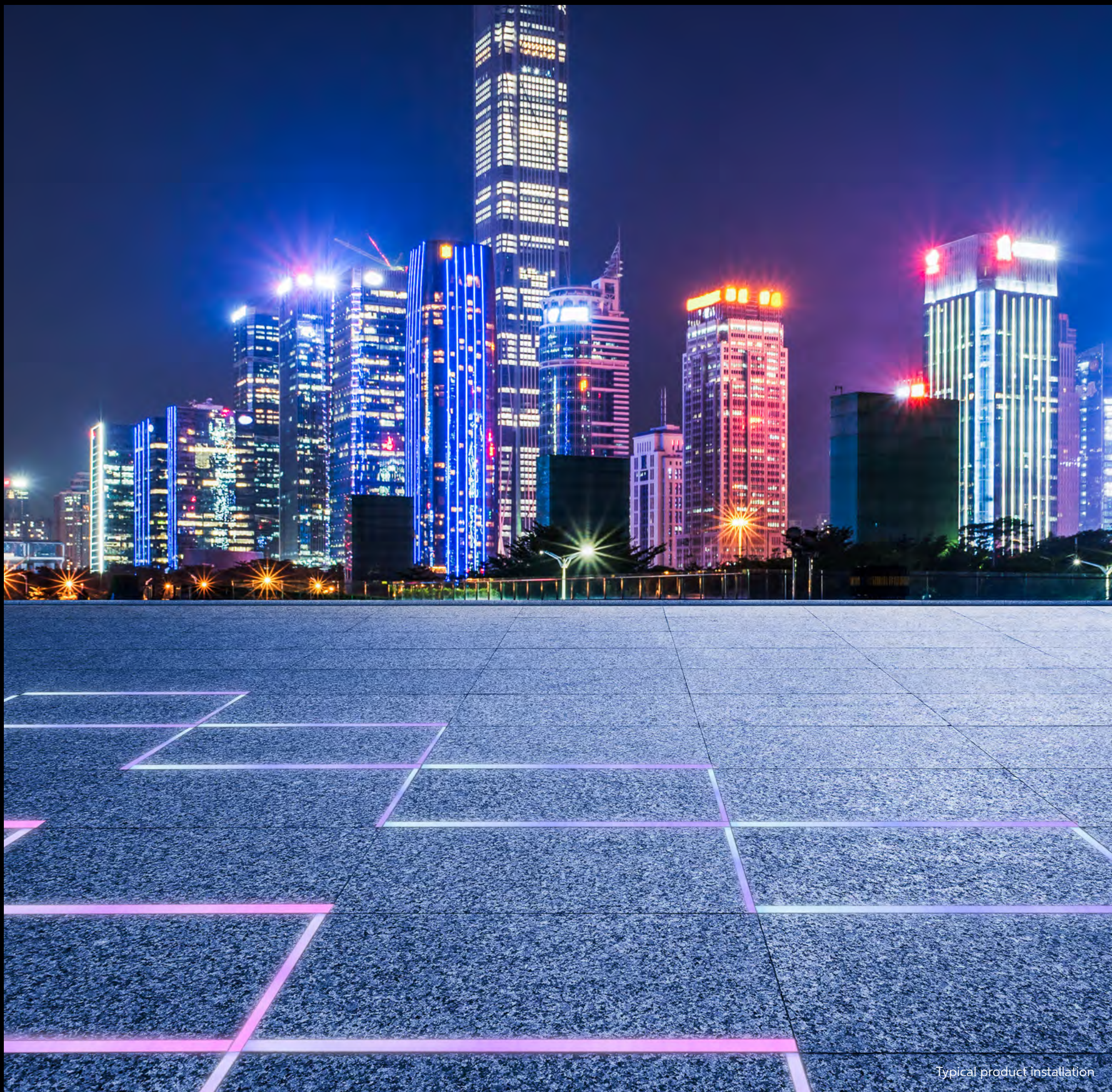
Typical product installation